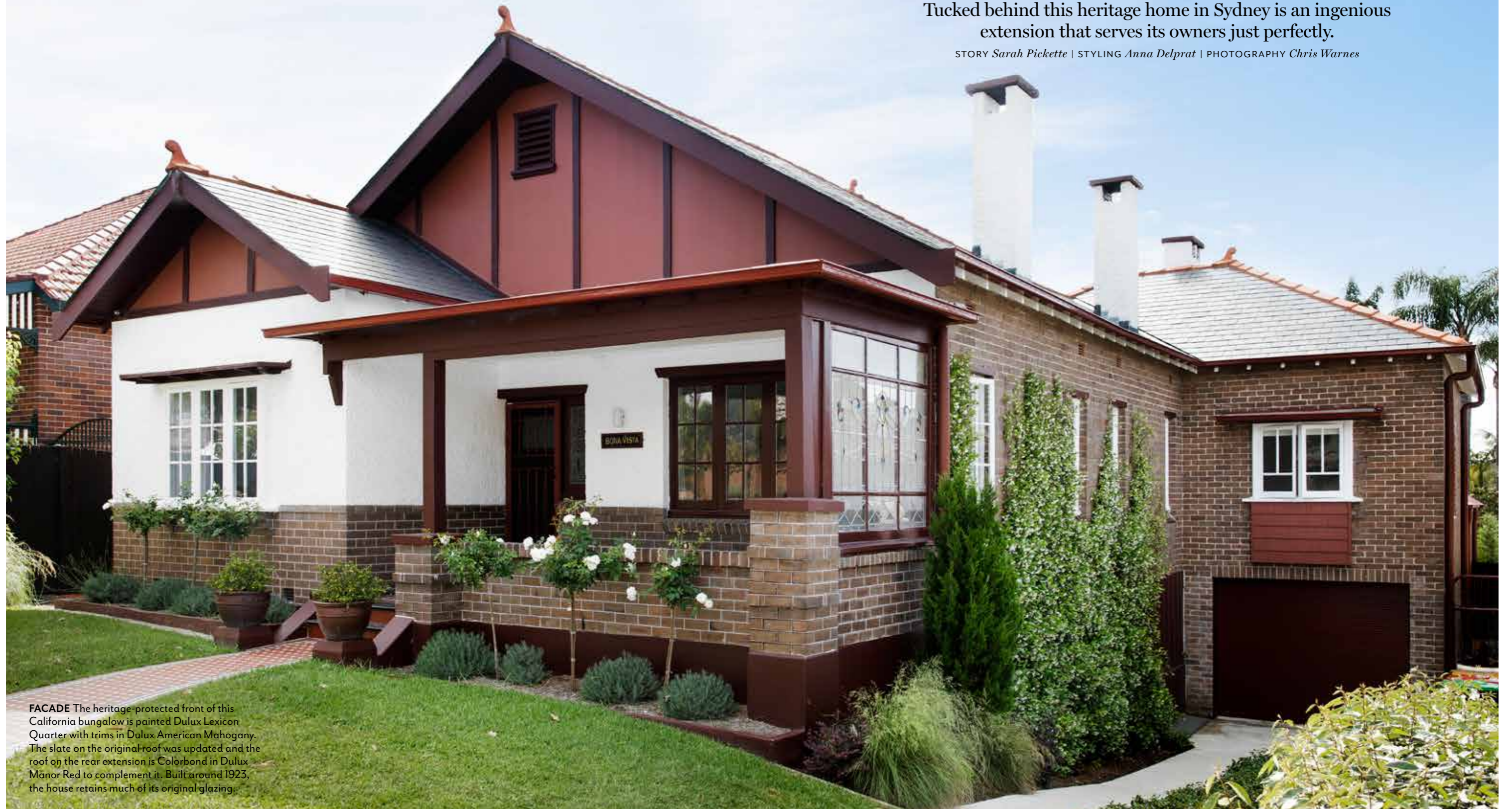
FACADE The heritage-protected front of this California bungalow is painted Dulux Lexicon Quarter with trims in Dulux American Mahogany. The slate on the original roof was updated and the roof on the rear extension is Colorbond in Dulux Manor Red to complement it. Built around 1923, the house retains much of its original glazing.