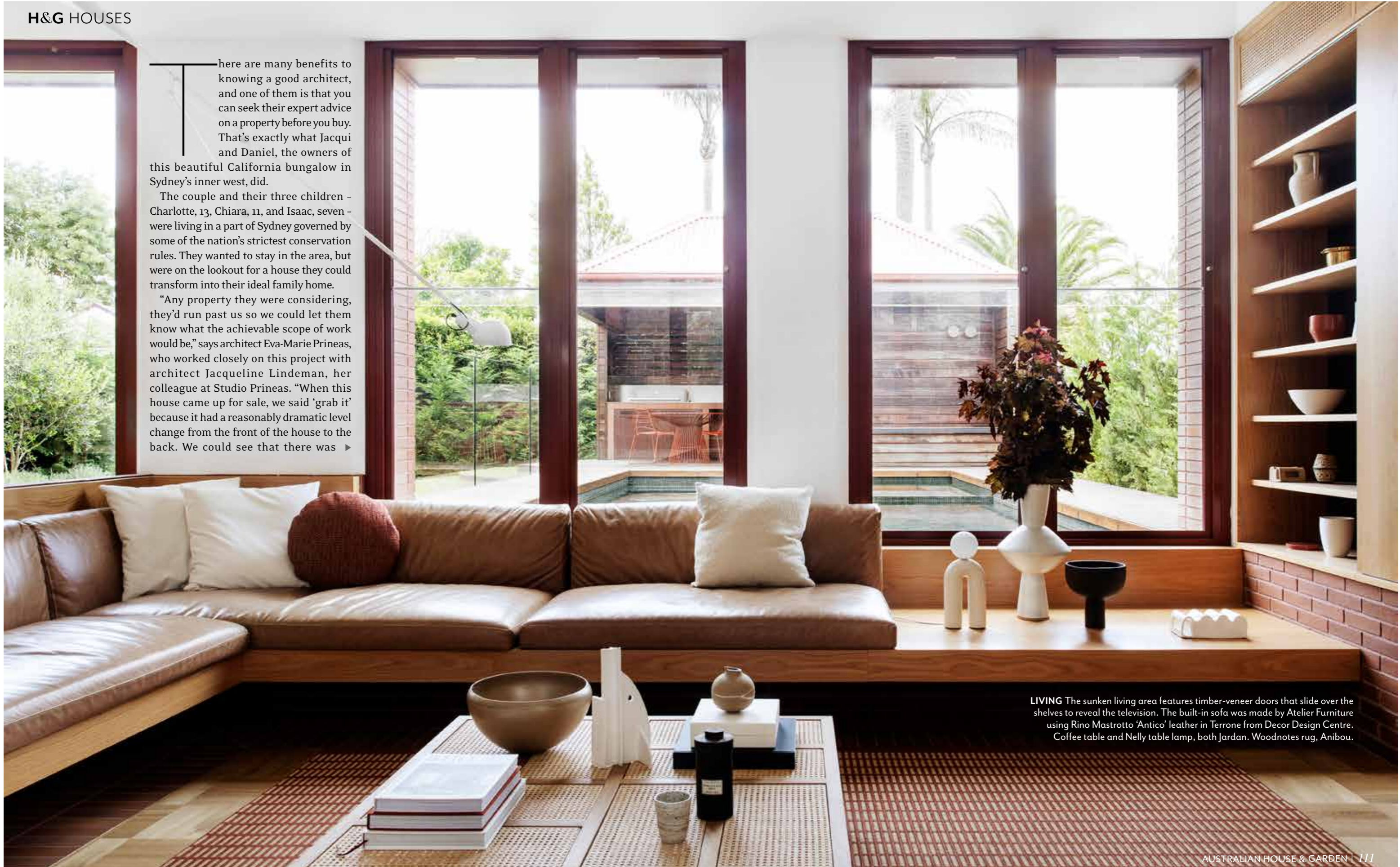
LIVING The sunken living area features timber-veneer doors that slide over the shelves to reveal the television. The built-in sofa was made by Atelier Furniture using Rino Mastrotto 'Antico' leather in Terrone from Decor Design Centre. Coffee table and Nelly table lamp, both Jordan. Woodnotes rug, Anibou.