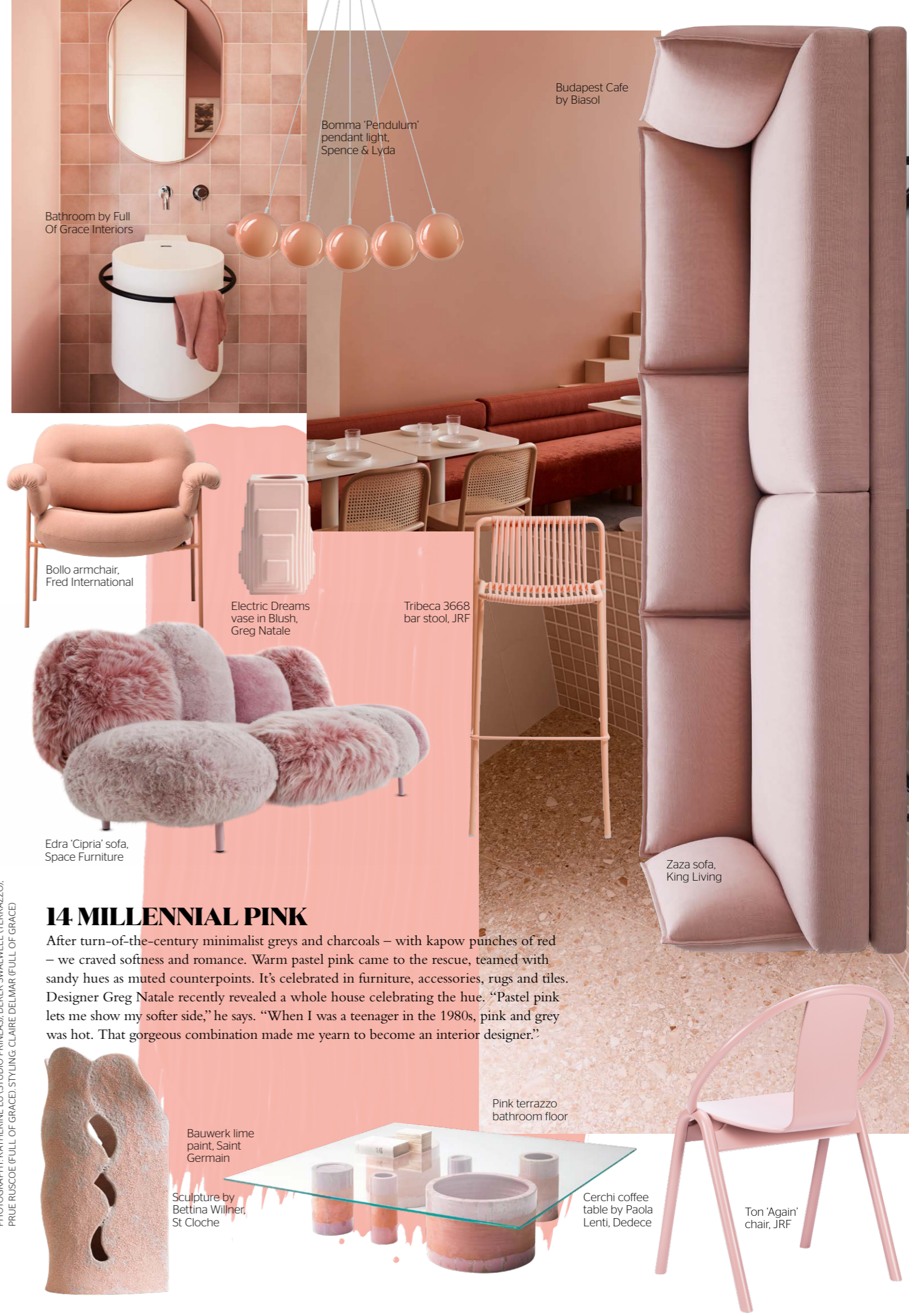
Bathroom by Full Of Grace Interiors