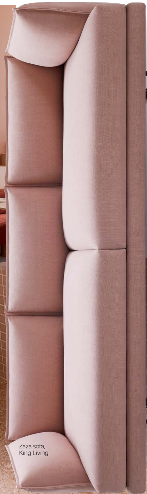
Zaza sofa, King Living