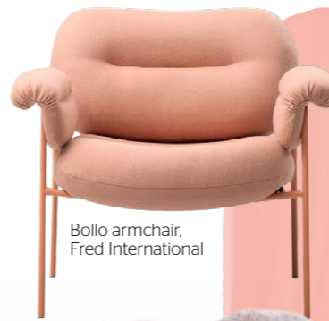
Bollo armchair, Fred International