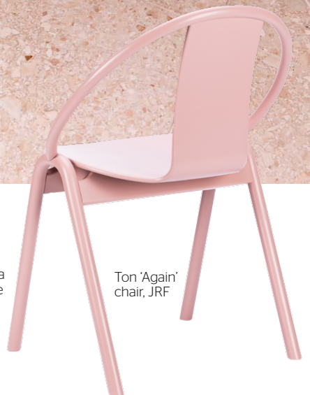
Ton 'Again' chair, JRF