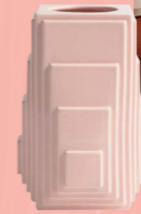
Electric Dreams vase in Blush, Greg Natale