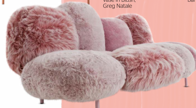
Edra 'Cipria' sofa, Space Furniture