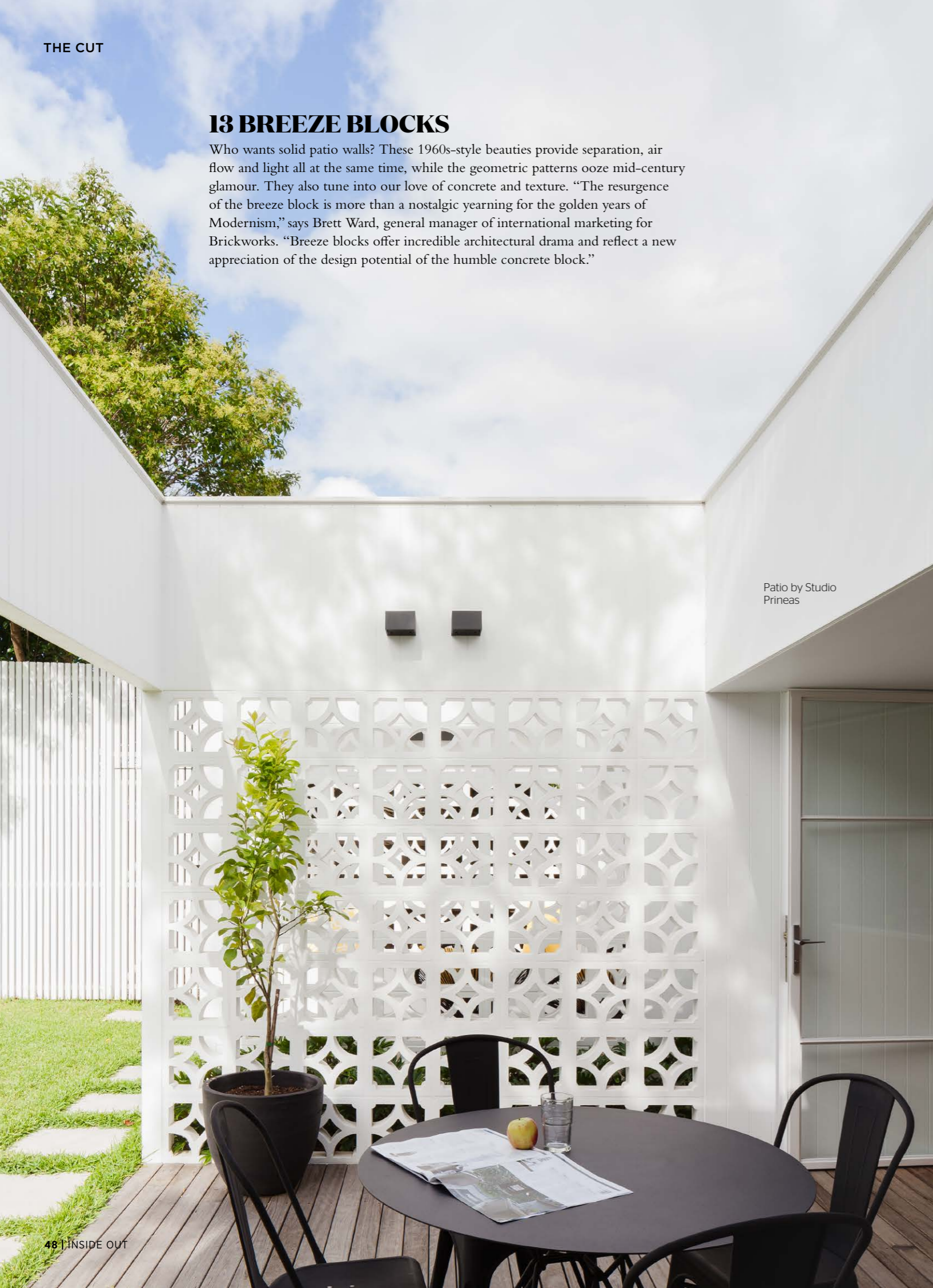
Patio by Studio Prineas

Who wants solid patio walls? These 1960s-style beauties provide separation, air flow and light all at the same time, while the geometric patterns ooze mid-century glamour. They also tune into our love of concrete and texture. “The resurgence of the breeze block is more than a nostalgic yearning for the golden years of Modernism,” says Brett Ward, general manager of international marketing for Brickworks. “Breeze blocks offer incredible architectural drama and reflect a new appreciation of the design potential of the humble concrete block.”